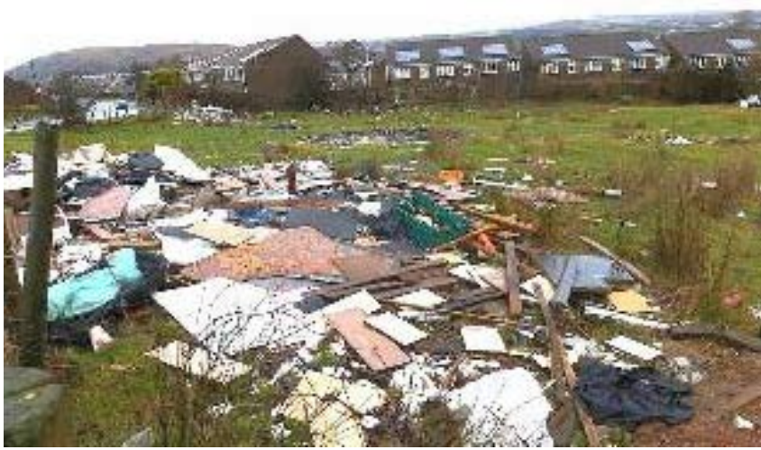
An action plan to clear fly-tipping from Twyncarmel field in Cyfarthfa is being put in place by Fly-tipping Action Wales and Cynefin

"Ironically, there is a sign there saying £1,000 fine for any one caught fly-tipping but this only seems to encourage peo-